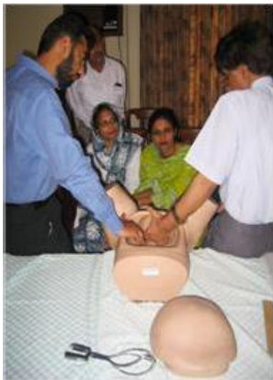
Obstructed labour demonstration

CAI Pakistan and MCAI have published articles in a number of peer-reviewed medical journals, which are available for download on this website.