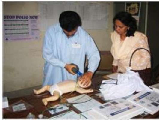
Bag and mask resuscitation

In November 2005, The World Health Organisation (WHO) in Pakistan and the Pakistani Government agreed to take on responsibility for spreading the courses across the entire country. They put together a funding consortium which will lead to the intervention becoming sustainable.