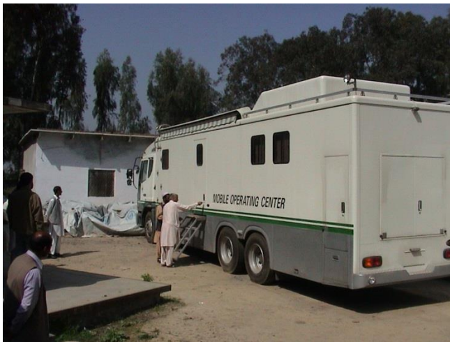
Mobile obstetric clinic