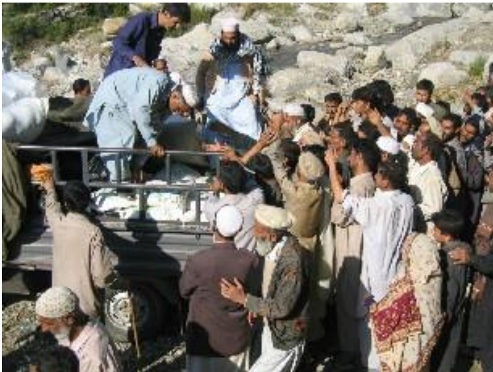
CAI Pakistan distributing essential food to survivors of the earthquake