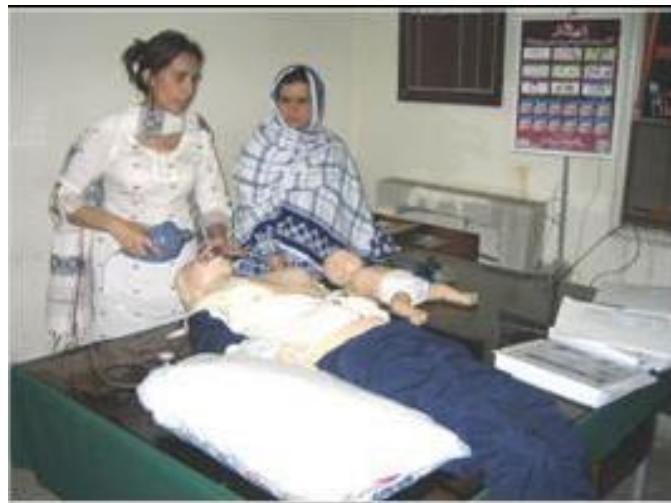
Resuscitation in pregnancy

The candidates on the MOET, APLS and EMNCH courses who performed well and showed abilities in team work and education were selected to undergo a Generic Instructor Course (GIC). Candidates on the GIC course were also willing to donate some time out of their schedule for undertaking future courses. This was a 3-days course meant to train the trainers on modern teaching methodologies involving lectures, workshops, scenarios and skill stations such as ESS-EMNCH. This course was also designed to enable and train the health professional in the art of disseminating training and replicating the programme activities in their own province. The participants who