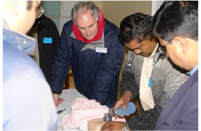
Training in BLS for health workers in the earthquake zone (it was very cold: winter)