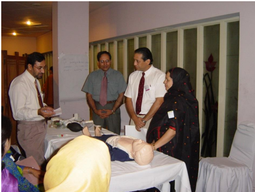
Scenario on major trauma