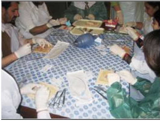
Surgical airway skill station