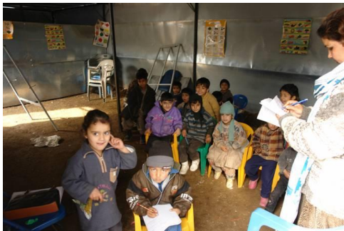
School in Jalalabad camp

By 2007 CAI Pakistan and MCAI had also donated emergency medical equipment to 6 of the hospitals in the earthquake affected areas.