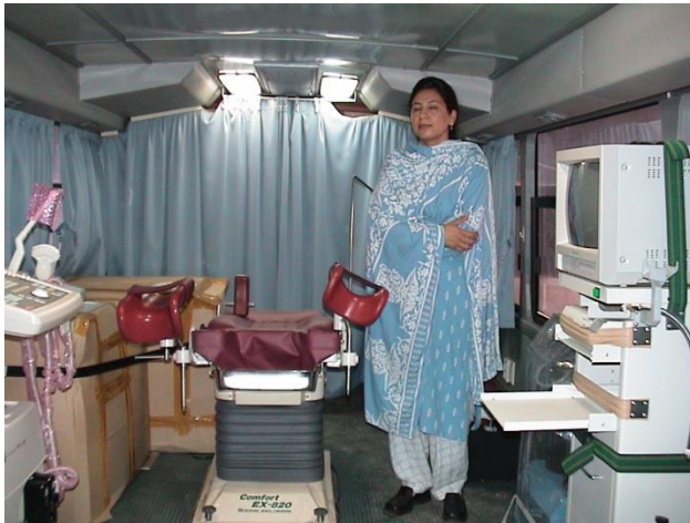
Obstetrician in her mobile labour ward

Afghan refugee families. Approximately 2000 patients were treated each month.