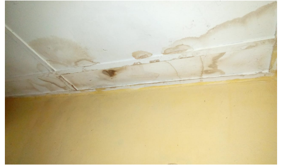
UNDER CEILING TILES BETWEEN ISOLATION WARD AND MALNUTRITION UNIT IS ASBESTOS