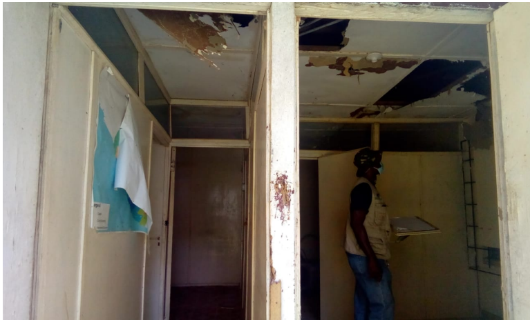
WALLS AND CEILINGS NEEDING MAJOR RENOVATION

Phebe hospital provides the only in-patient children's unit for a population of 419,000 people in Bong county.