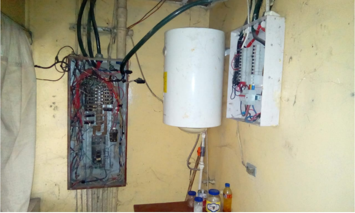
EXPOSED AND COMPLETELY UNSAFE ELECTRICAL FITMENTS IN THE CHILDREN'S WARD